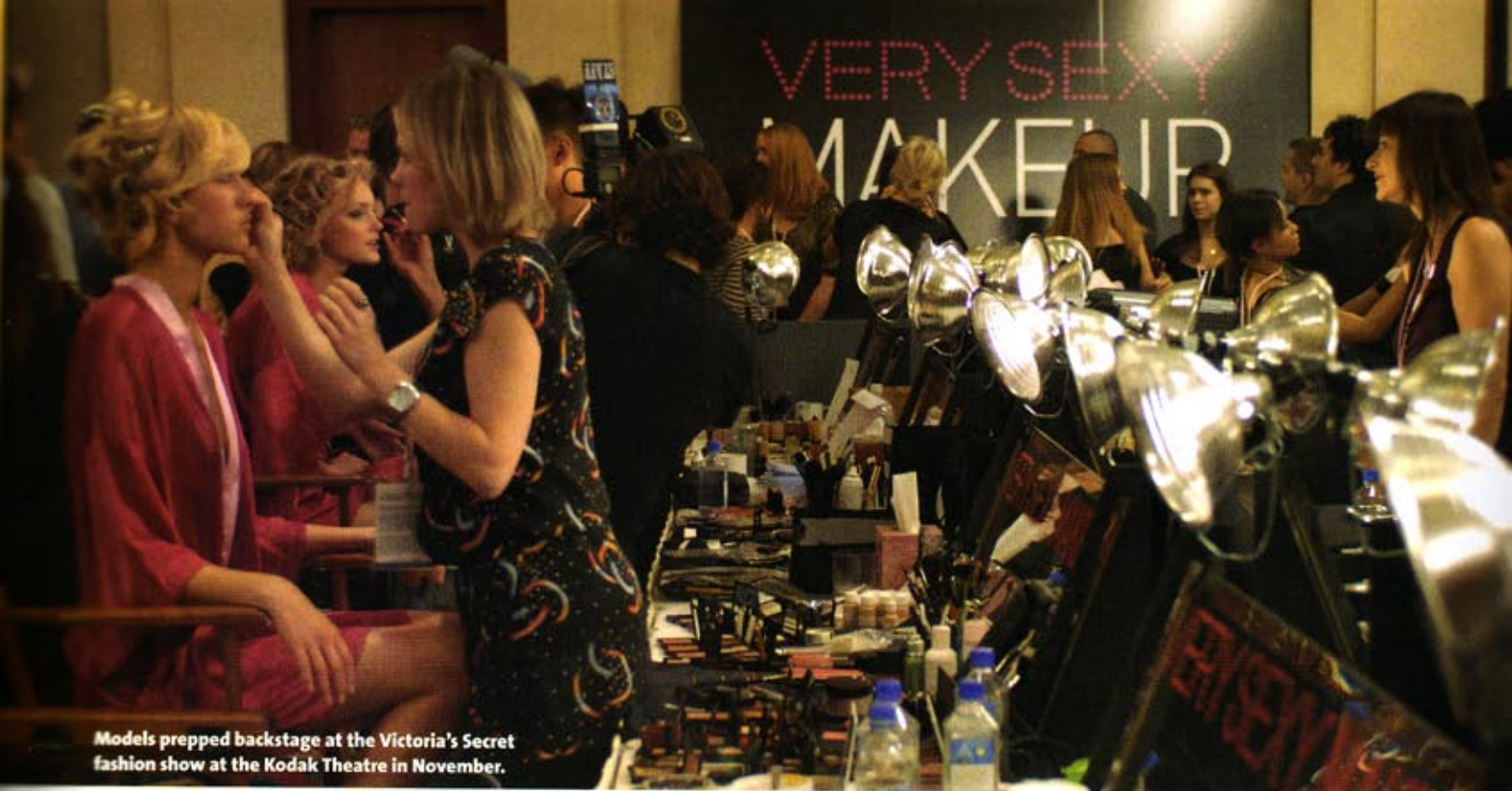
Models prepped backstage at the Victoria's Secret fashion show at the Kodak Theatre in November.